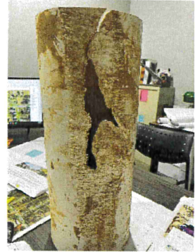
Figure 1 - Water line damaged during work done in the right of way.